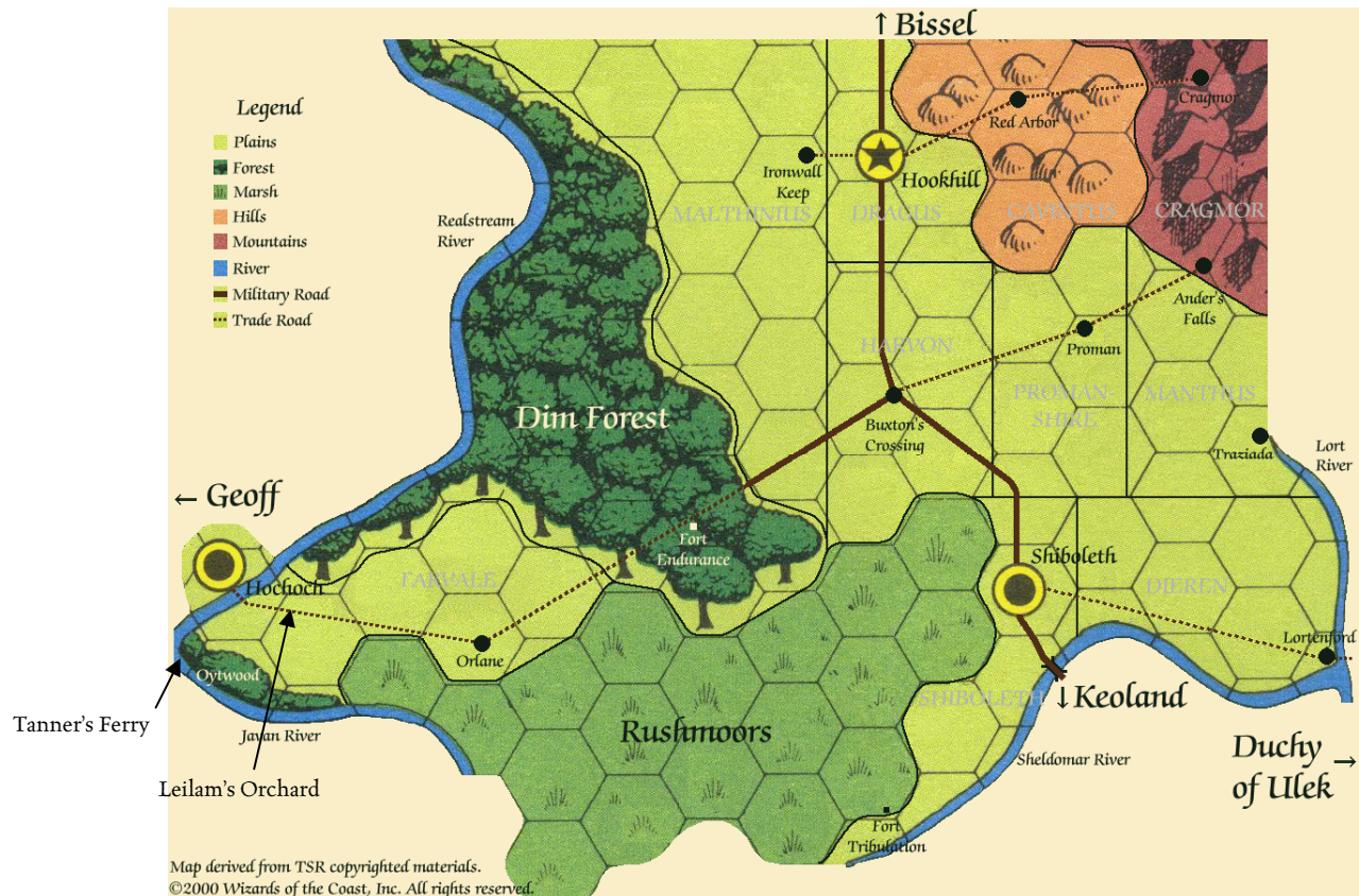
MAP OF GRAN MARCH